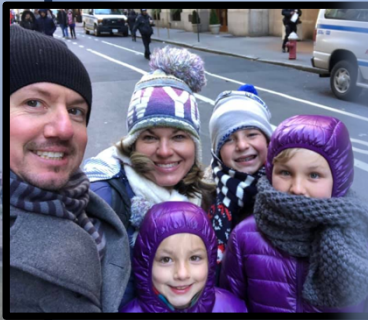
The Glenn Family watch the Macy's Thanksgiving Day parade in NYC.