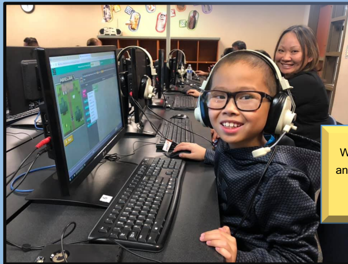
We are grateful to our GPAC and teachers who set a Family coding night.