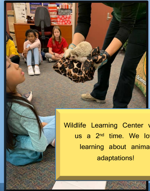
Wildlife Learning Center visited us a 2 nd time. We love learning about animal adaptations!