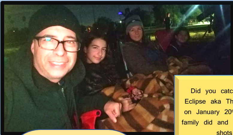
Did you catch The Lunar Eclipse aka The Blood Moon on January 20 th ? The Suarez family did and got some great shots too!