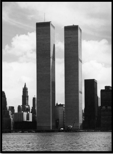
Above: The Twin Towers before 9/11/01. Below: The 4 th annual GATE Color Run, Blaze Pizza Fundraiser Night and Baskin Robbins Back to School!

As a few of the people who were interviewed said, some countries do not have this unity and freedom that we have. These are privileges and should not be taken for granted. We shouldn’t be thinking that freedom and unity is available in other countries, because not all of them have these elements. Recently, Clara Barton held a Color Run. This Color Run is an example of how diverse our school is. No matter what your race is, what your culture is, gender, or which country you came from you still get a free and quality education, (but you get the best at Barton!! Not that we are competitive or anything). And at the end of the day we all ended up green, blue, and purple anyway.