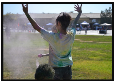
The Color Run!